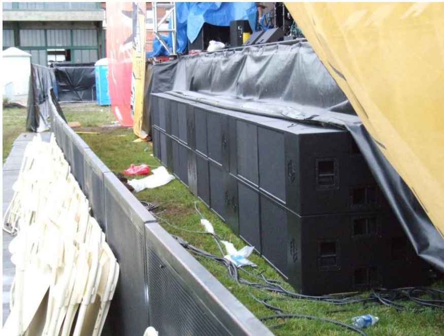
Fig.3 – Central Mono Block

In order to reduce the classic "bowling alley" effects when stacks are used in a traditional left/right format, some users prefer to array their Quakes as a single line across the front of the stage. Not only does this method give extra horn area in one place, but will provide an even dispersion rather than a strong +6dB boost on the centreline as with L/R systems. The photo in Fig.3 shows USA rental company Big Mo Productions using 16 Quakes in a central mono block for the LibertyJAM festival in 2006.